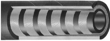
PRO WBL 30